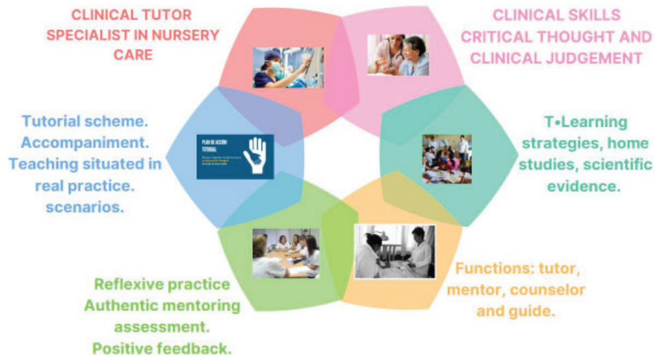
Figure 3: Clinical tutoring: the hexagonal model of training in the PUEE.

The investigate specialized nursing students' experiences of supervision during clinical practice [17] and to compare students who were satisfied with the supervision with those who were dissatisfied with respect to a) organization of supervision and number of preceptors, as well as time allocated by preceptors for b) supervision, c) reflection, d) discussion of intended learning outcomes, and e) assessments of students' performance by preceptors. This study indicates that supervision, in terms of discussions and reflections, of specialized nursing students is significant for learning experiences and satisfaction during clinical placement.