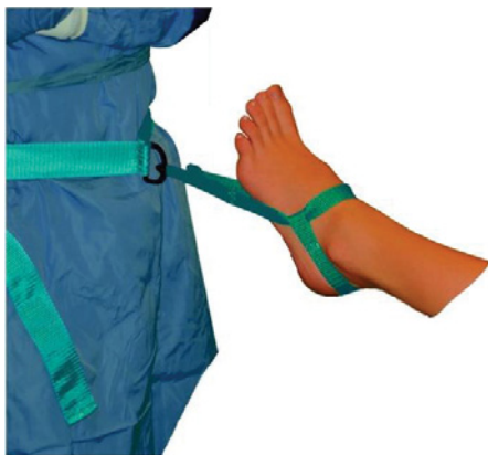
Figure 1: Surgeon's body traction [5].