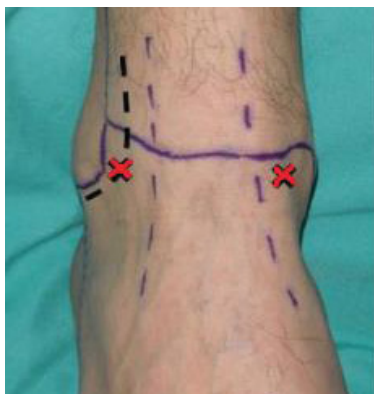
Figure 2: Portal into the joint.