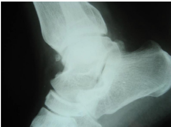
Figure 4: Frontal bone Spurs cause impingement.

There are two surgical postures associated with dilated joints, the first is the dilatation by folding knee posture with 90° of the surgeon's stretching, and the second is the surgeon's trunk with legs stretched straight posture. In general, both ways give good articulation results and convenient for conducting endoscopy.