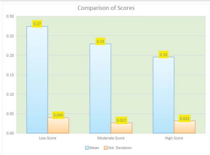
Figure 1: Mean and Standard Deviation of Low, Moderate and High Scores.