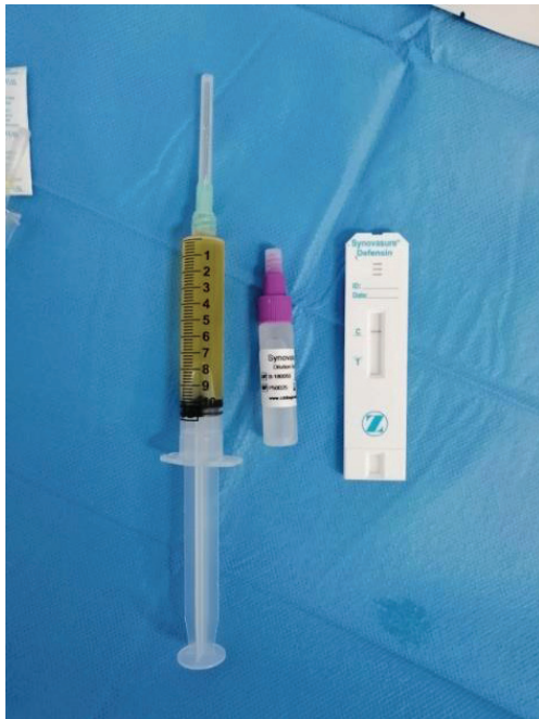
Figure 2: Alpha-Defensin Kit showing single line (negative result).